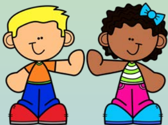
AIR HIGH FIVE